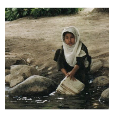
This Afghan child, collecting water from a polluted surface water source, benefits from the SWS project that began in 2003