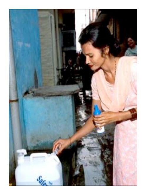
A woman in Delhi treats water stored in a SWS container with PSI/India Safewat water treatment solution

A Low-Cost Technology for Safe Drinking Water